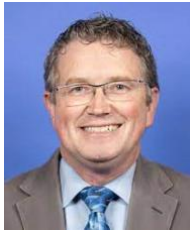
U.S. Rep. Tom Massie (R)

Northern Kentucky pro-life Congressman Rep. Thomas Massie (R) will present an update of pending legislation before the U.S. Congress as to the life issues.