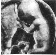
IT'S A CHILD, NOT A CHOICE