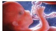
How much is my life worth?

That there is no more critical issue cannot be denied: 3,800 innocent babies killed each day in the U.S. by surgical abortion; many thousands more by chemical abortion; the rapid advance of the Nazi practices of human experimentation, cloning, embryonic stem cell extractions, etc. - all of which we have documented in the pages of these newsletters, even though they are being soft-pedaled and misrepresented generally in the communications media.