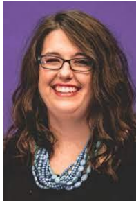
President of Students for Life