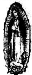
Our Lady of Good Hope