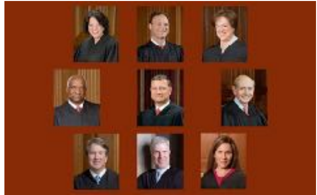
Current U.S. Supreme Court Justices