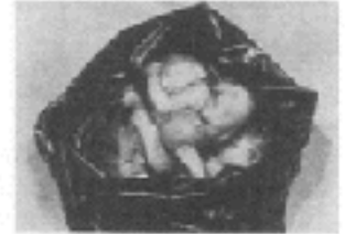
Garbage bag of 15-week unborn infants killed by hysterotomy abortion (Caesarean section)

Vol. 49, No. 1 P.O. BOX 1202, COVINGTON, KY 41012 Web Page Address: www.nkyrtl.org