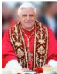
Pope Benedict XVI

Prior to his election as Pope Benedict XVI , Cardinal Joseph Ratzinger , Prefect of the Congregation of the Doctrine of the Faith , issued a letter in 2004 to the bishops of the United States that those officeholders who publicly support legalized abortion, and the public funding thereof, should not present themselves for Holy Communion, and if they do, should not be given Holy Communion.