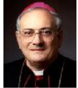
Bishop Nicholas DiMarzio Bishop of Brooklyn, NY

The Court continued: "The State has not claimed that attendance at the applicants' services has resulted in the spread of the disease. And the State has not shown that public health would be imperiled if less restrictive measures were imposed."