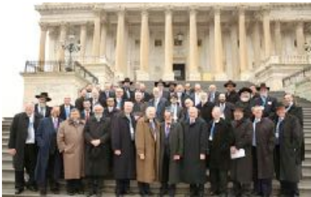
Agudath Israel of America

On the eve of Thanksgiving, in the case Roman Catholic Diocese of Brooklyn, New York v. Andrew M. Cuomo, Governor of New York , the Court held "...that enforcement of the Governor's severe restrictions on the applicants' religious services must be enjoined." Applications from the Diocese of Brooklyn and from Agudath Israel of America , sought release from the Executive Order of Cuomo which placed severe restrictions on attendance at religious services in areas classified as "red" or "orange" zones. In red zones, only 10 persons could attend religious services, and in orange zones the cap was 25.