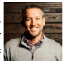
Pastor J.D. Greear

"Do you want to protect the innocent? Do you want to defend the vulnerable? Are you committed to social justice? Do you want to fight systemic injustice?" asked Pastor J.D. Greear, President of the Southern Baptist Convention , one of several virtual speakers at the 2021 March for Life .