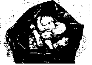
Garbage bag of 18-week unborn infants killed by hysterotomy abortion (Caesarean section)

Vol. 47, No. 4 P.O. BOX 1202, COVINGTON, KY 41012 Web Page Address: www.nkrytl.org