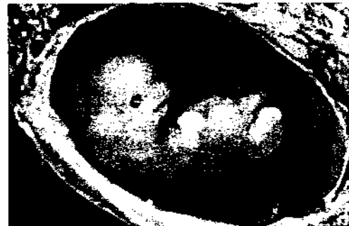
Unborn baby, 6 weeks gestational age from conception

The makers of the film Gosnell found their ads also being censored by Facebook . Live Action News , known for its undercover investigations of Planned Parenthood , complains that Twitter has been censoring their ads, which told them to change the information on their website if they wanted to advertise on Twitter .