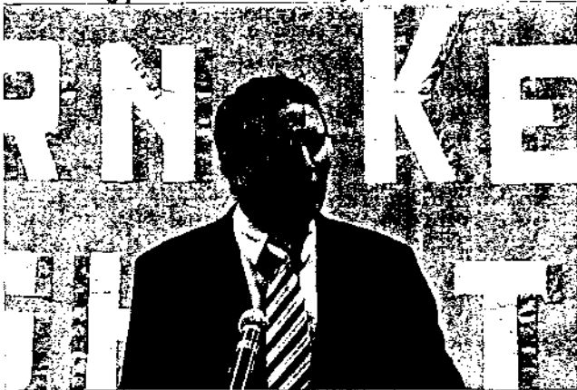
U.S. Rep. Thomas Massie

When I was 24 and my wife was 22, and I was still a graduate student, and she had just finished undergraduate school, we found out that we were going to have a baby. It wasn't the time in our lives when we expected to have a baby, when we planned to have a baby. We were finishing school and were about to get our careers started. But we were excited to have this baby, and we were pro-life. But this is when I went from being pro-life to adamantly pro-life.