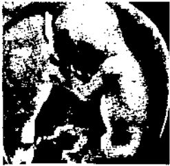
IT'S A CHILD, NOT A CHOICE