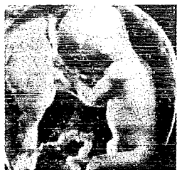
IT'S A CHILD, NOT A CHOICE