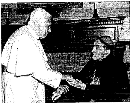
Cardinal Dulles with Pope Benedict XVI